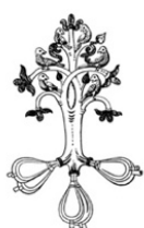
Associazione musicale "Vincenzo Colombo" di Pordenone